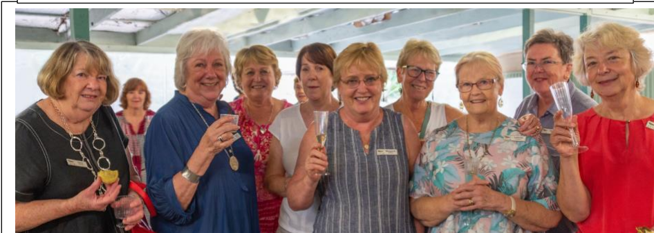
The Usual Suspects enjoying end of Congress drinks